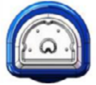
4 Pole | Key 1 Plug Face