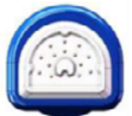
14 Pole | Key 1 Plug Face

For additional information about pulseOne or any other product, please contact an Amphenol Alden Product Specialist today.