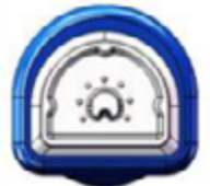
7 Pole | Key 1 Plug Face