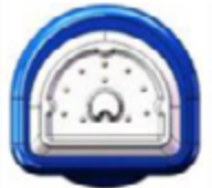
10 Pole | Key 1 Plug Face